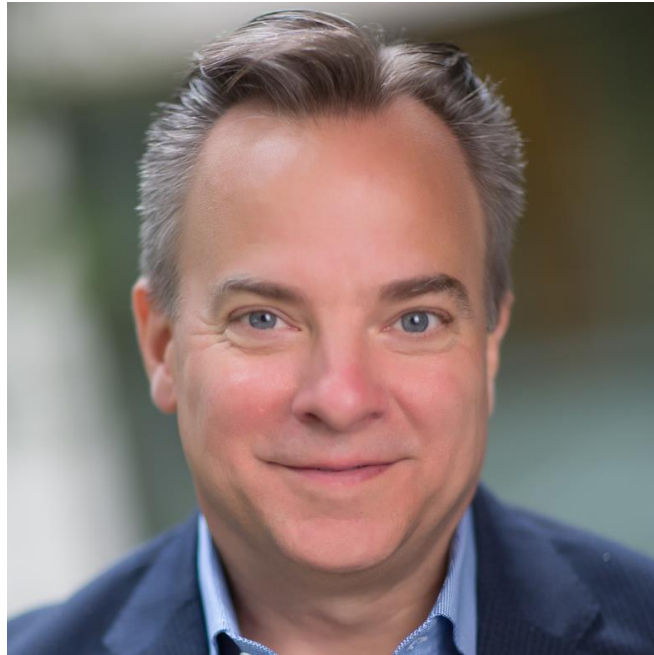
Mark McClellan, MD, PhD LAN Guiding Committee Co-Chair